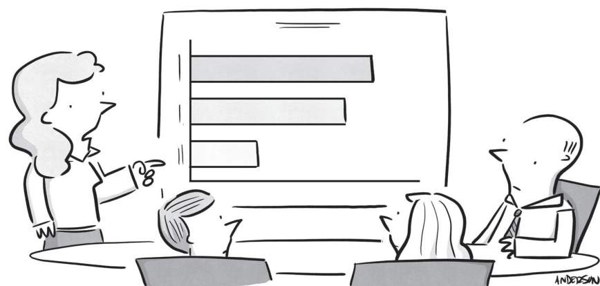
"Serendipity is up, fluke is doing well, but I'm a little concerned about our dumb luck."