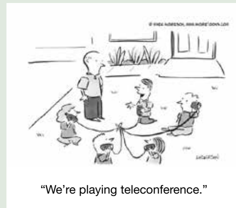
“We're playing teleconference.”